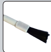
Long Life Brush

Low-cost consumables make the TIG Brush the clear class-leader in value for money.