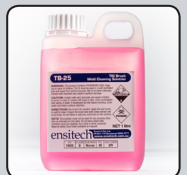
TB-25 Weld Cleaning and Polishing Fluid