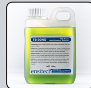
TB-30ND Non-Dangerous Weld Cleaning Fluid